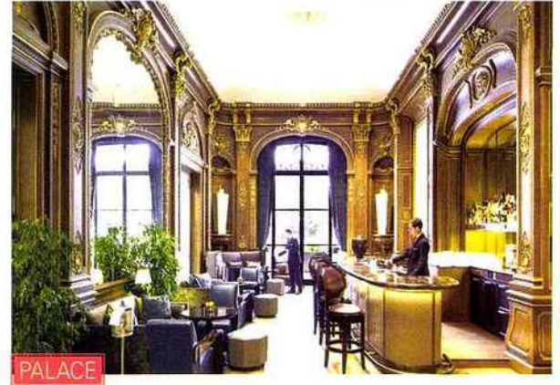
The rooftop of L'Oiseau Blanc restaurant is one of the summer hot spots in Paris while the LiLi is a destination for Cantonese cuisine lovers. Below, the lavish decor of le Bar Kléber and the hotel's 20-meter swimming pool.